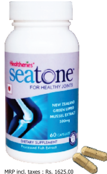
MRP incl. taxes : Rs. 1625.00 Pack size : 60 capsules

This combination of active compounds gives seatone a broader range of activities compared with glucosamine and chondroitin 1 .